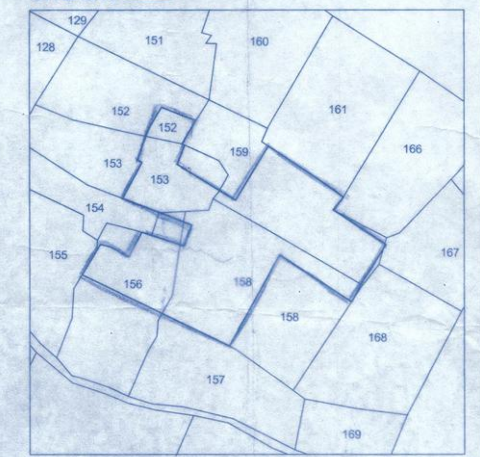
LEMAMIDI GRAM PANCHAYATH EXTRACT OF VILLAGE MAP SITE U/R

REFERENCE: LAYOUT BOUNDARY EXISTING ROADS PROPOSED ROADS MORTGAGE AREA